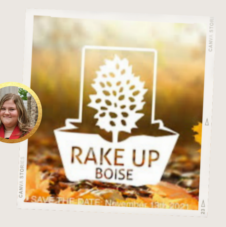
Ourshee High School