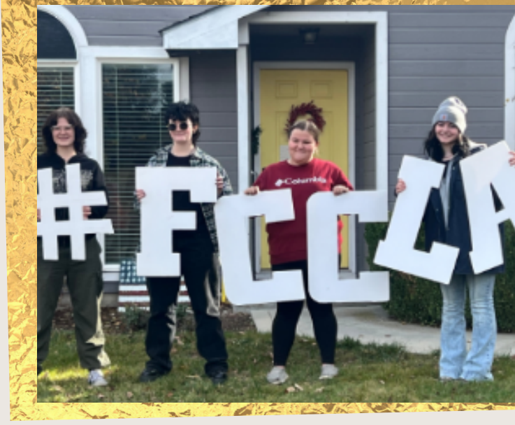
Centennial High School